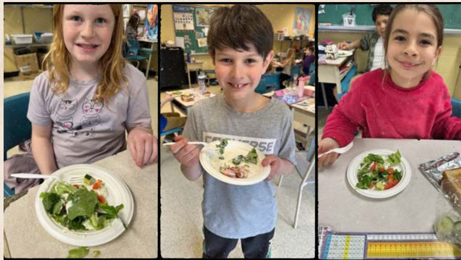
Our grade 3 class had a great time making salads recently from lettuce and spinach grown right in the classroom! Staff brought in some extra items to make the meal a bit more palatable. Great work!

June 5: Irving Nature Park school trip. Details to come.